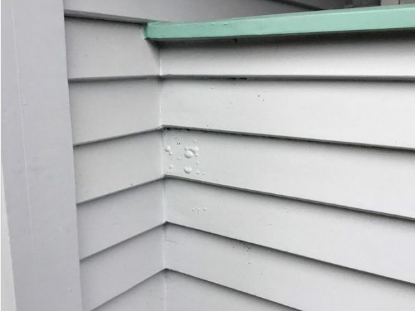
25. Some paint needs attention