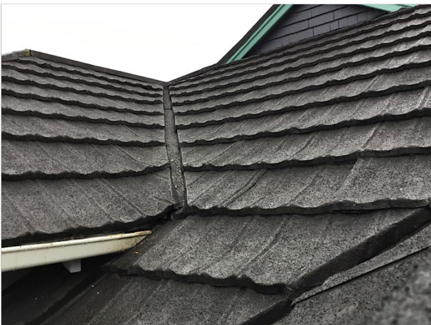
5. Typical roof