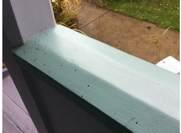
26. Borer on front porch