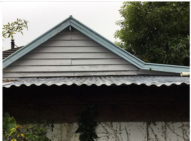
28. Sleepout gable needs painting