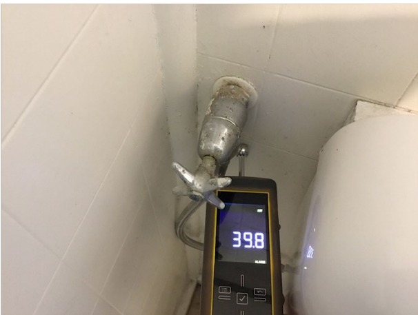
17. Beside toilet water supply