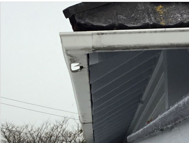
29. Damaged gutter above garage