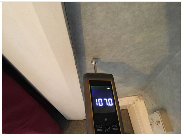
18. High reading in living