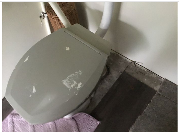
24. Unfinished flooring in sleepout toilet