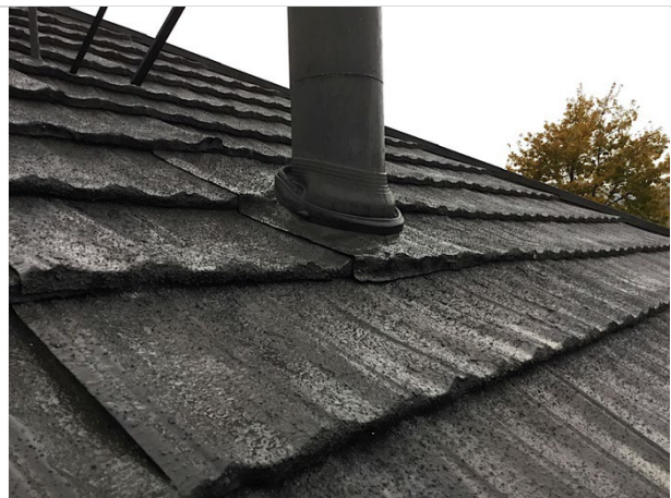
6. Roof penetration