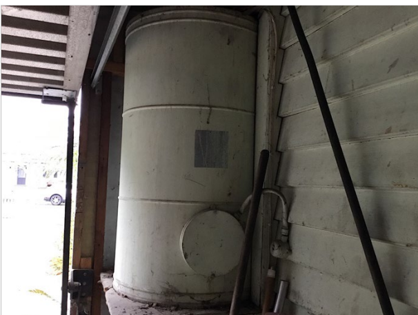
11.Low pressure HWC