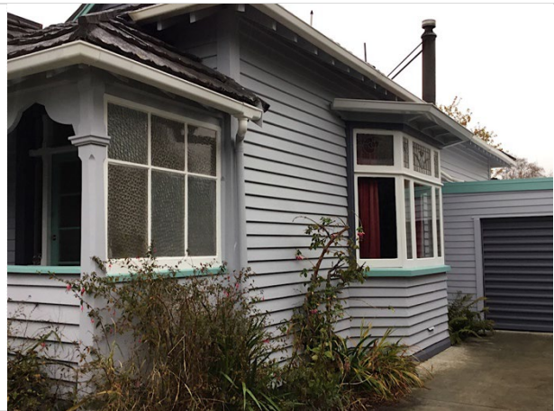
4. West elevation