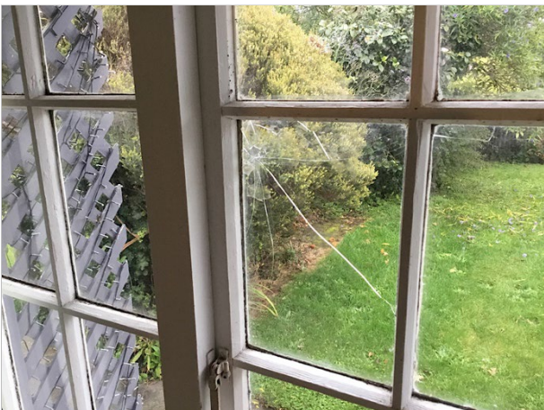
23. Broken sleepout window