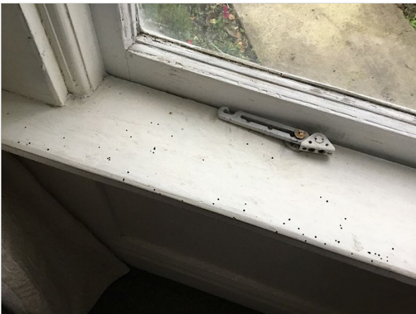
21. Borer in bedroom 1