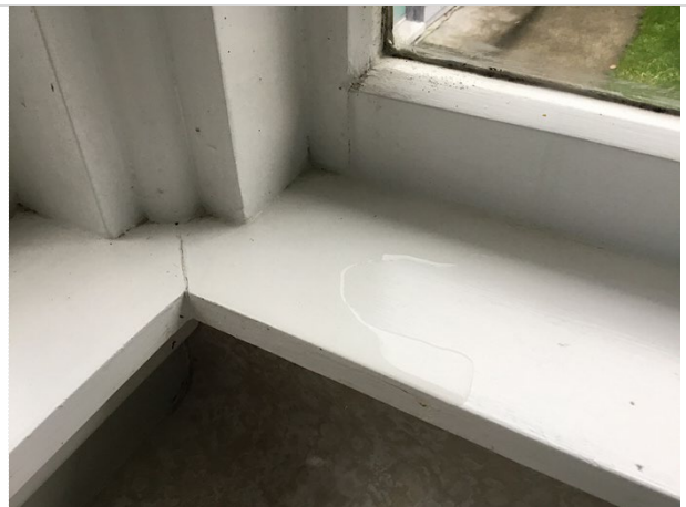
22. Water in kitchen from windows