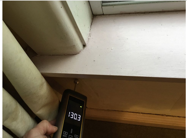
14. High moisture reading in bedroom 2