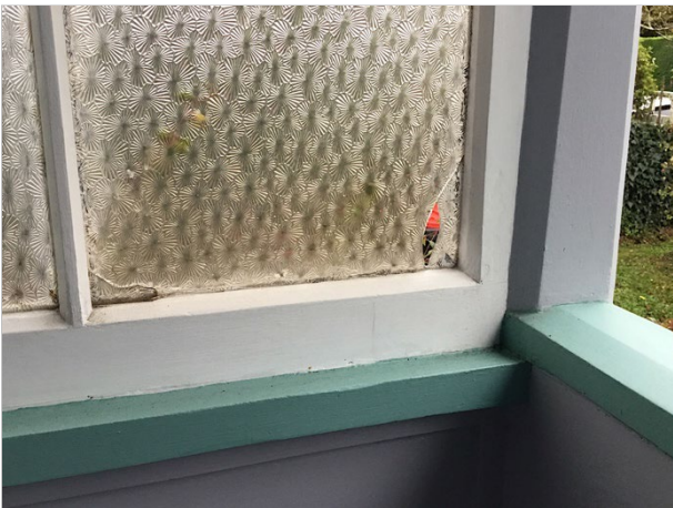
27. Broken glass on front porch