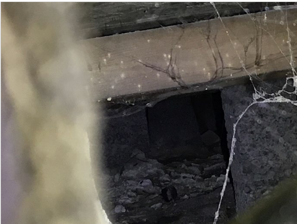
9. Typical pile, no subfloor moisture barrier