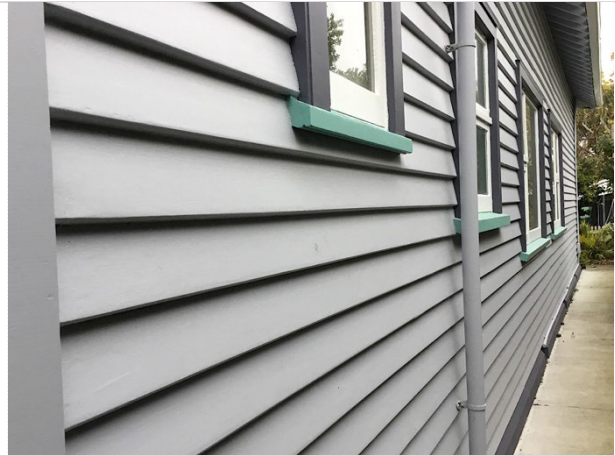
2. East elevation