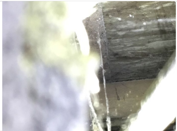
10.No subfloor insulation