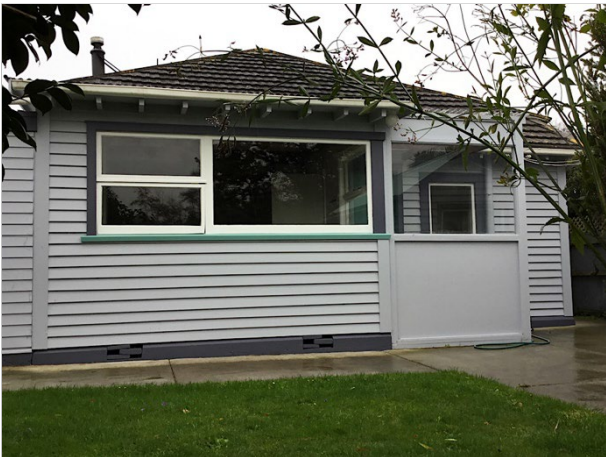
3. South elevation