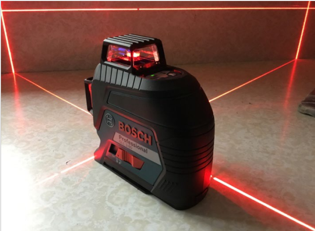
13. Floor levels checked with laser level