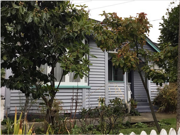
1. North Elevation