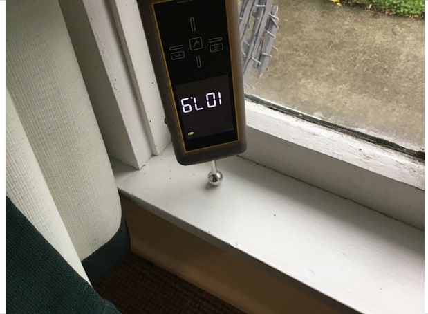
20. High reading in sleepout