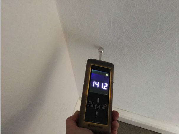
19. High reading in entrance