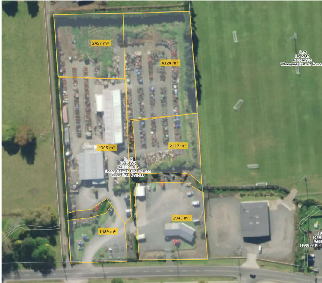
Fig 2 – Preliminary Scheme Plan

We have prepared the preliminary sketch for the proposed development of your property based on our discussions. If the layout is not in accordance with your expectations, please let us know.