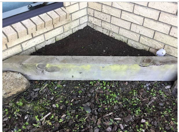
24. Remove soil from bottom brick course vents