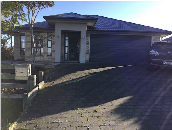
3. South elevation