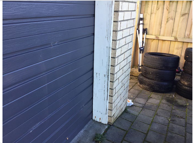
20. Garage door jamb needs painting