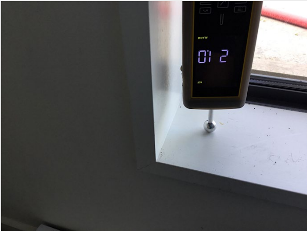
13. Typical window reveal reading