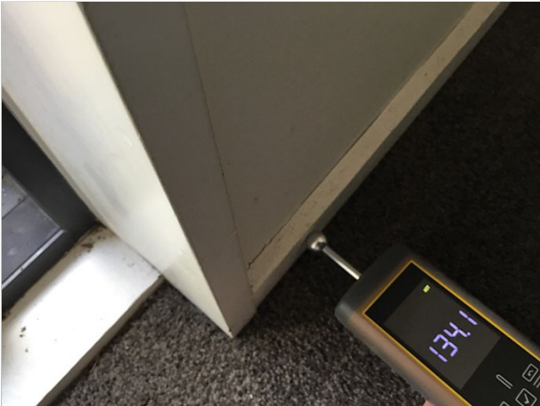
19. Beside living slider