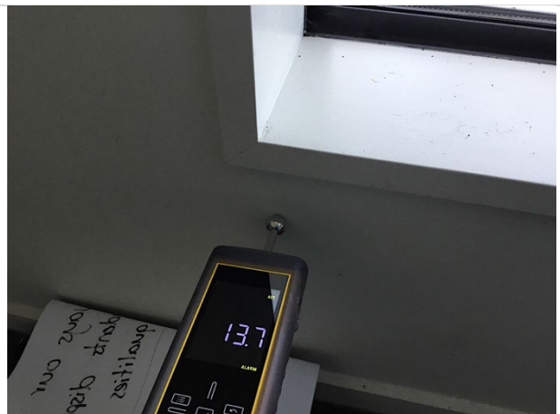
12. Typical low moisture reading under windows