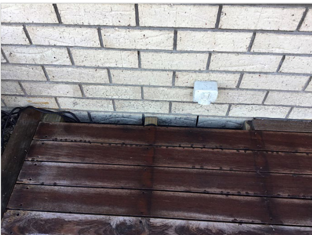
23. Install missing decking