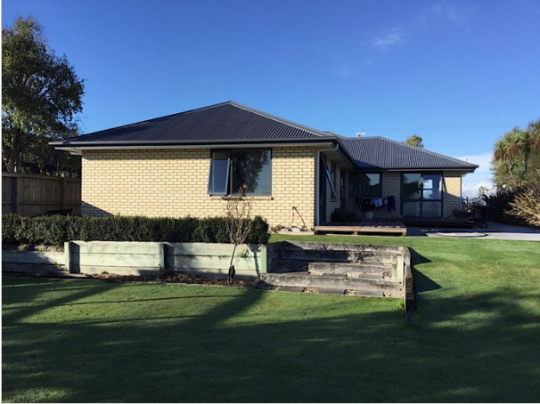
1. North elevation