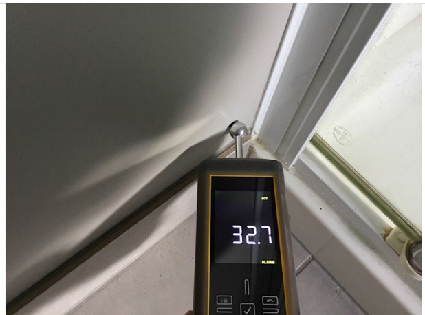
16. Beside bathroom shower