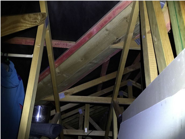
7. Roof structure