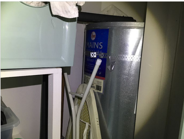
9. 250L mains pressure HWC manufactured 2009