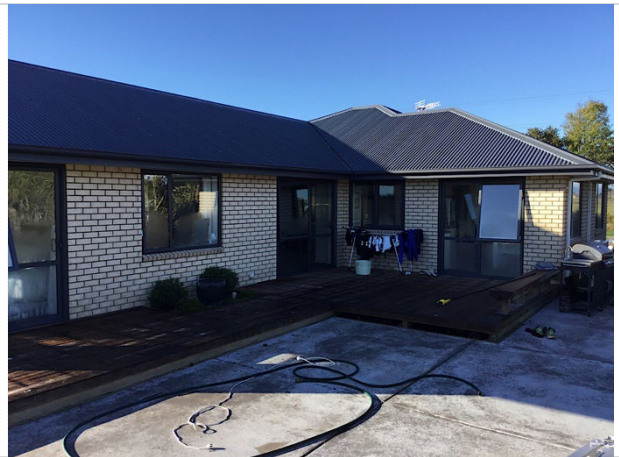
4. West elevation