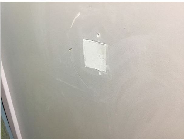
29. Unfinished toilet wall repair