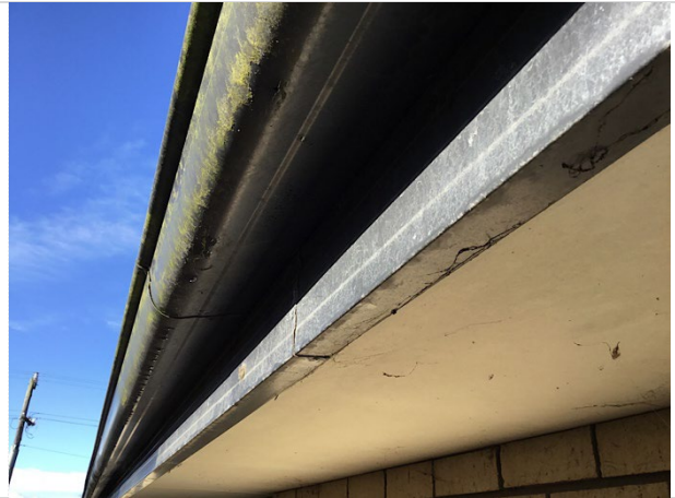
26. Gutter needs cleaning inside and out