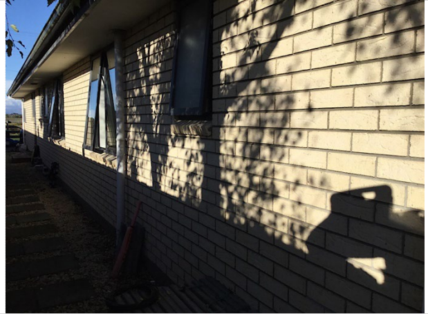
2. East elevation