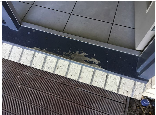
22. Front door sill needs painting