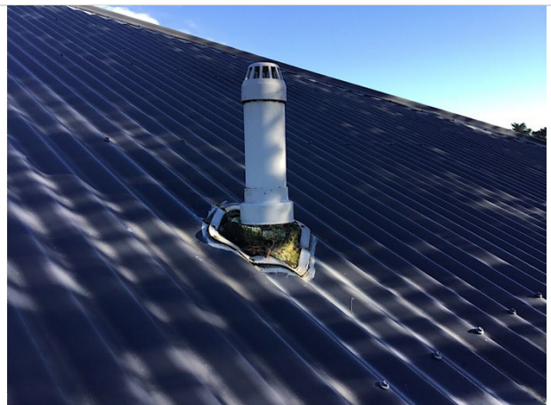
6. Roof penetration