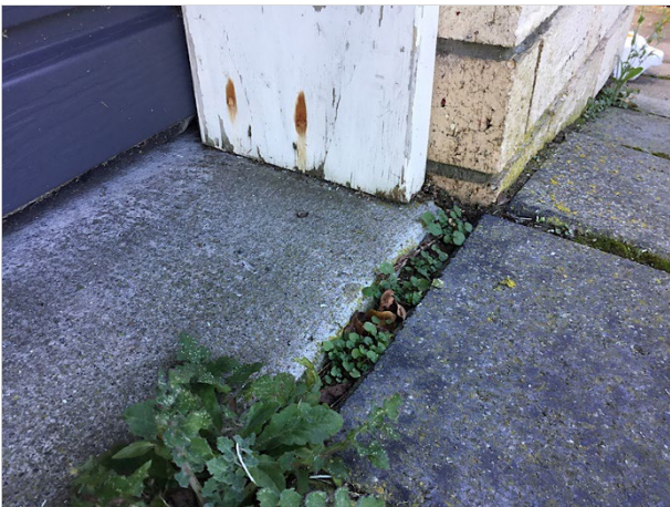
21. I recommend 12mm gap between garage door jamb and concrete to prevent moisture transfer