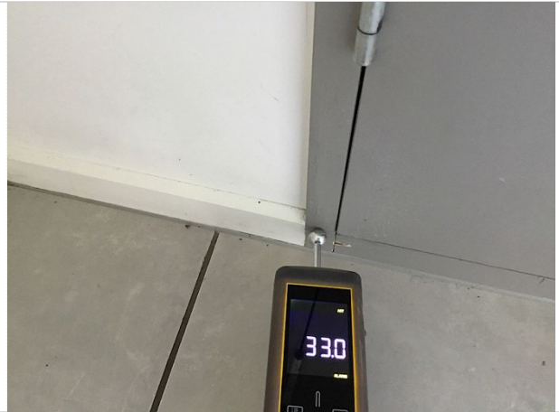
14. Beside exterior doors