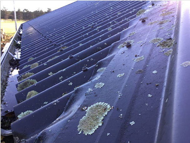
25. Roof needs lichen treatment