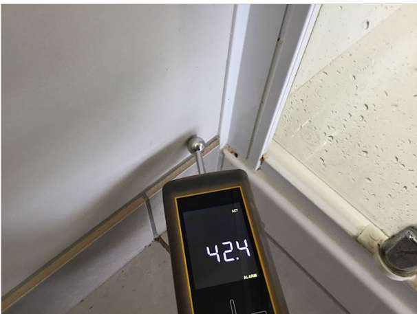
17. Beside ensuite shower