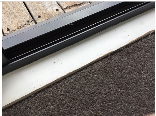
30. Dining living slider reveal needs painting