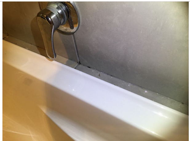
28. Spots of mould in bath cradle silicone