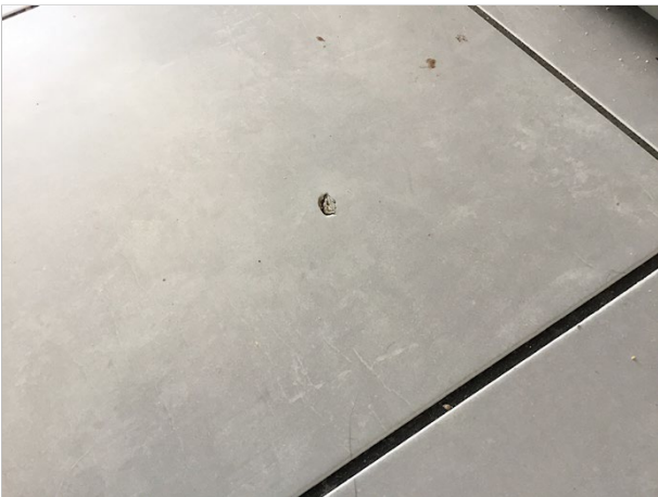
27. Chipped kitchen tile