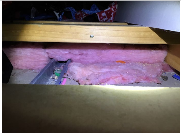
8. Ceiling insulation