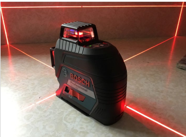
11. Floor levels checked with laser level