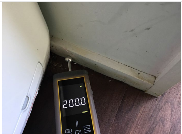
18. Beside washing machine