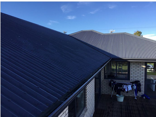
5. Typical roof