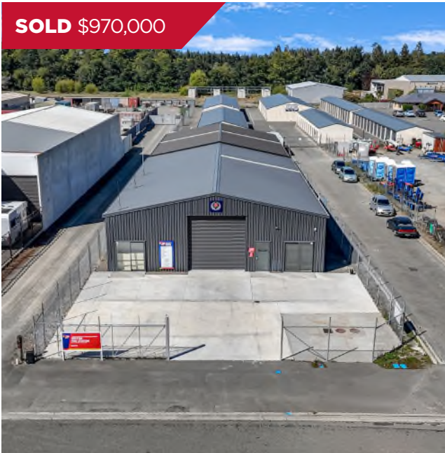
Rangiora 14C Newnham Street