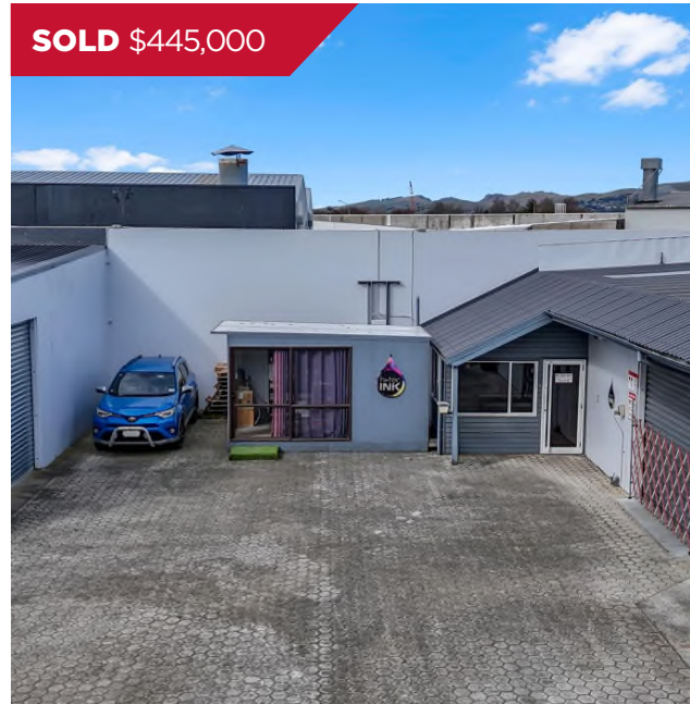
Middleton 231D Annex Road